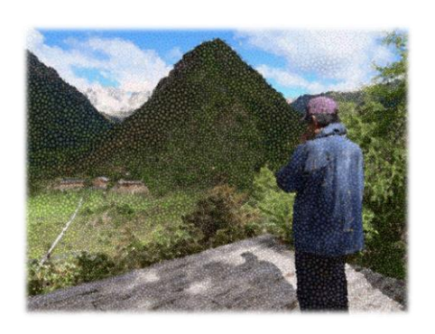
* East Asia Environment Exchange Project *