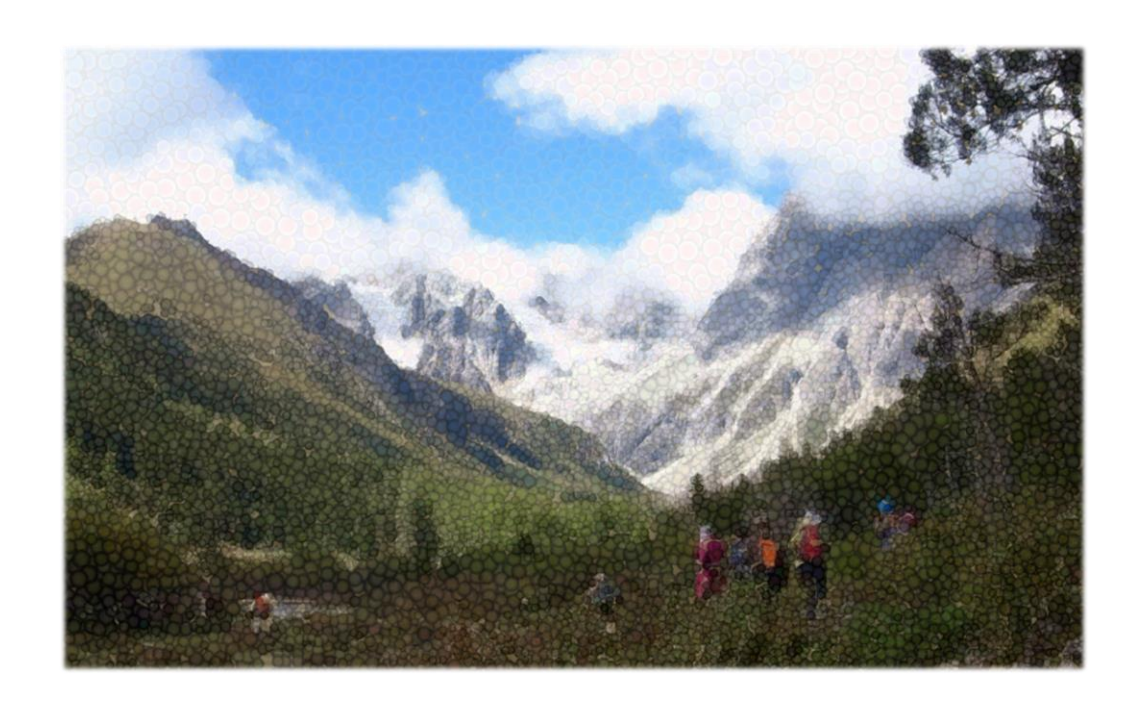
Ecotourism Guide Book of Baima Snow-Mountain Area

Japan-China Civil Society Network (Edit) act beyond trust (Support)